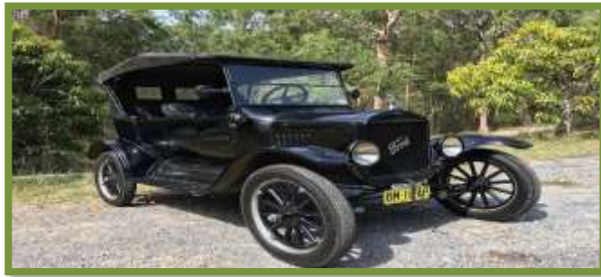
Picture of Ford Model T

Several inventors built cars during that time. Henry Ford was one of them. Beginning in 1903, Henry Ford made a series of cars, including the Model T (also known as the Ford Model T). Ford named his first car the Model A and proceeded through the alphabet up to the Model T, twenty models in all. The model immediately before the Model T was the Model S, an upgraded version of the Model N. The Model S had larger tyres than previous models. This made riding on bumpy roads more bearable. Also, the Model S had an additional seat at the back called a rumble seat. This seat was spacious and ideal for transporting an adult or children.