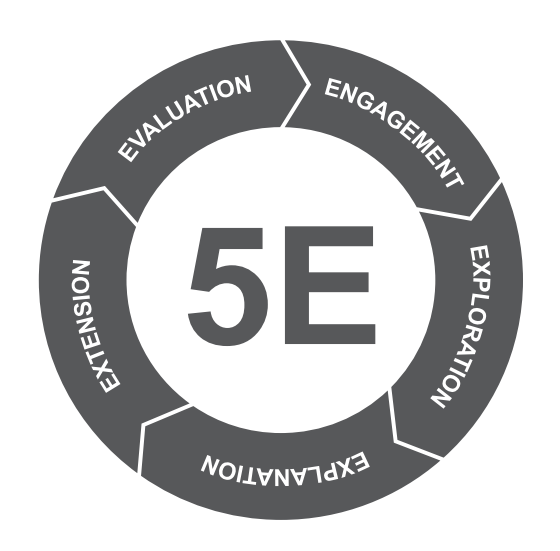
Figure 2, illustrating a cyclical perspective of the model with each process being given similar emphasis in contributing to the learning experience on a whole.